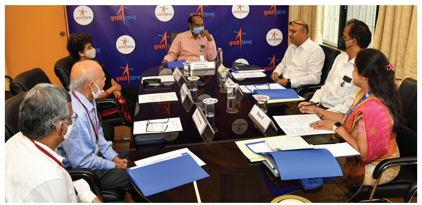
Extra Ordinary General (EGM) meeting held on 24th September 2021

Accordingly the authorised capital of the Company as on date is INR 1000,00,00,000/-(Rupees One Thousand Crores only) divided into 100,00,00,000 equity shares of INR 10/- each and the total issued and paid-up capital of the Company as on date is INR 710,00,00,000/-(Rupees Seven Hundred and Ten Crores only) divided into 71,00,00,000 equity shares of INR 10/- each fully paid up.