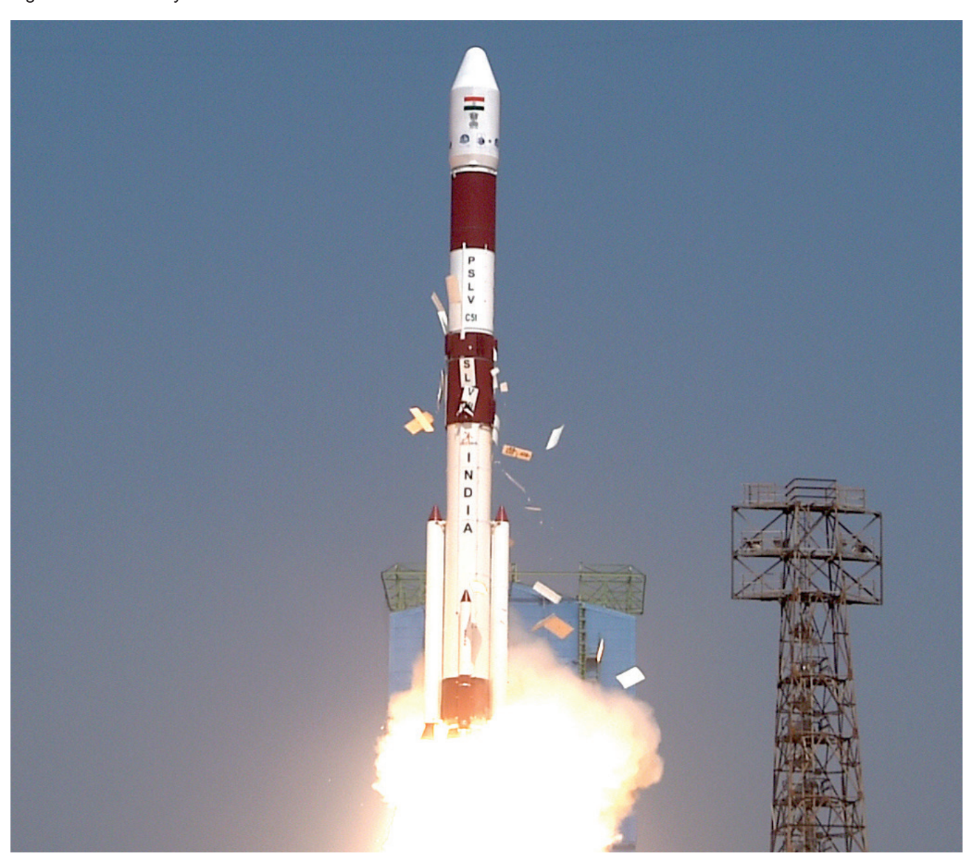
Launch of PSLV-C51/Amazonia-1 on February 28, 2021

The details on the business operations are provided in the Management Discussion and Analysis Report . One of the major achievements during the year was the launch of Amazonia-1 satellite of INPE, Brazil onboard PSLV-C51 flight on 28 February 2021. PSLV-C51/ Amazonia-1 Mission was the First Dedicated Commercial Mission of NSIL.